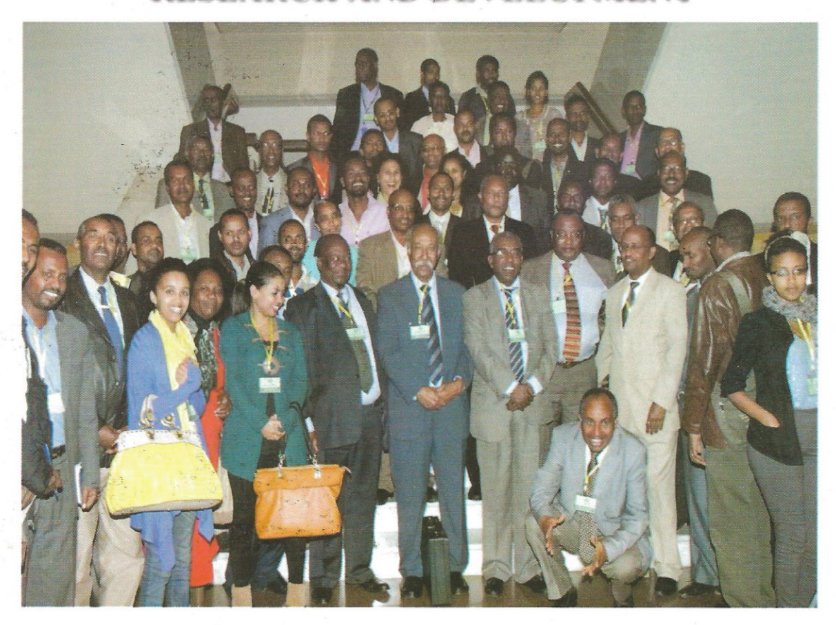
The 11<sup>th</sup> Annual International Conference on Private Higher Education

Committed to research and quality of education, as stated in its vision and mission, St Mary's University College has been organizing and sponsoring annual national conferences on Private Higher Education in Ethiopia since 2003. Its unabated and consistent efforts over the years have enabled the UC last year to align its force with the African Union, Association of African Universities and jointly issue the Addis Ababa Declaration which appealed to governments and stakeholders offer the needed attention to the private sector so that it responds to the public demand