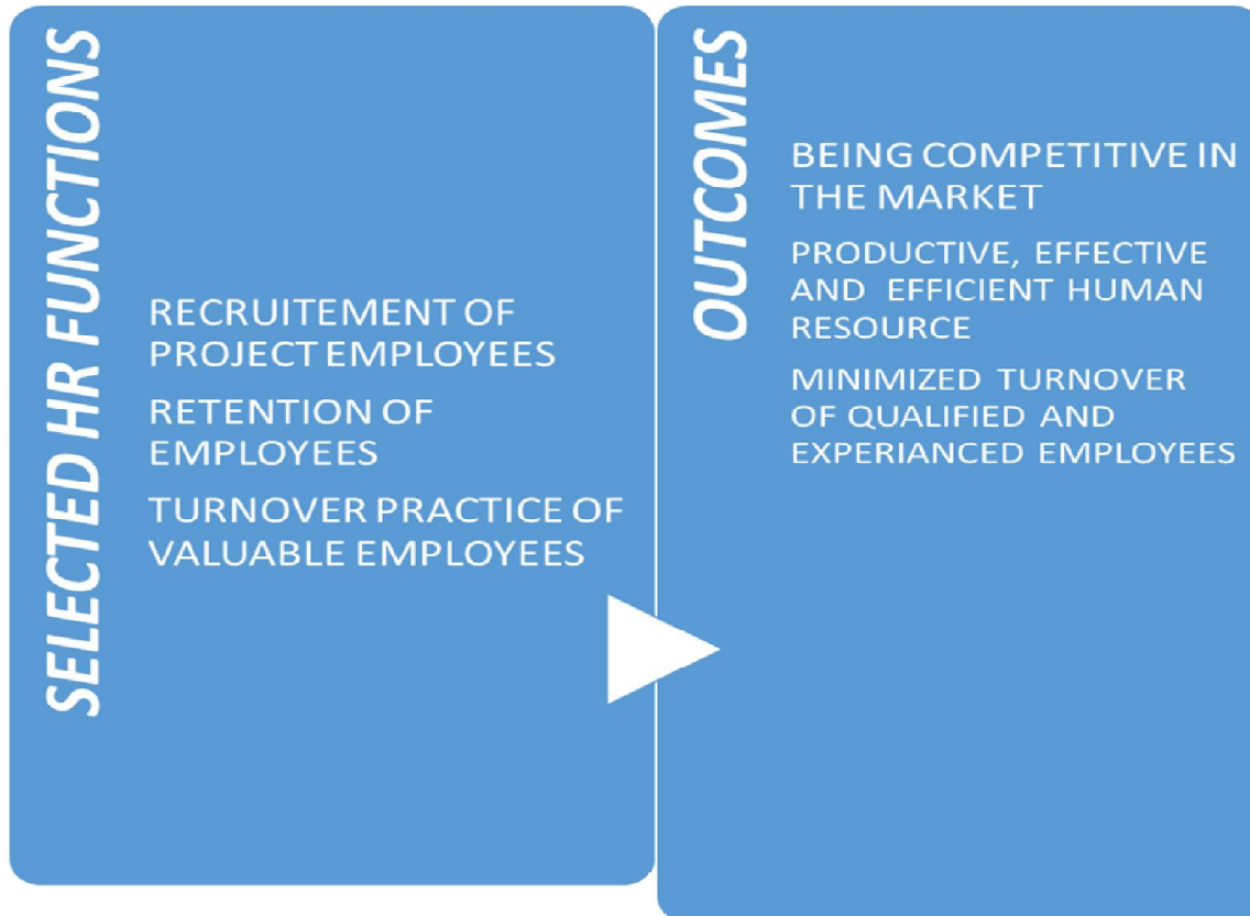
Figure 2.1. Conceptual Framework: the recruitment, retention and turnover practices and their outcome

The selected HR activities in this study; recruitment, retention and turnover, the approach to address them and the outcome on the company's operation and sustainability is illustrated in the conceptual framework below.