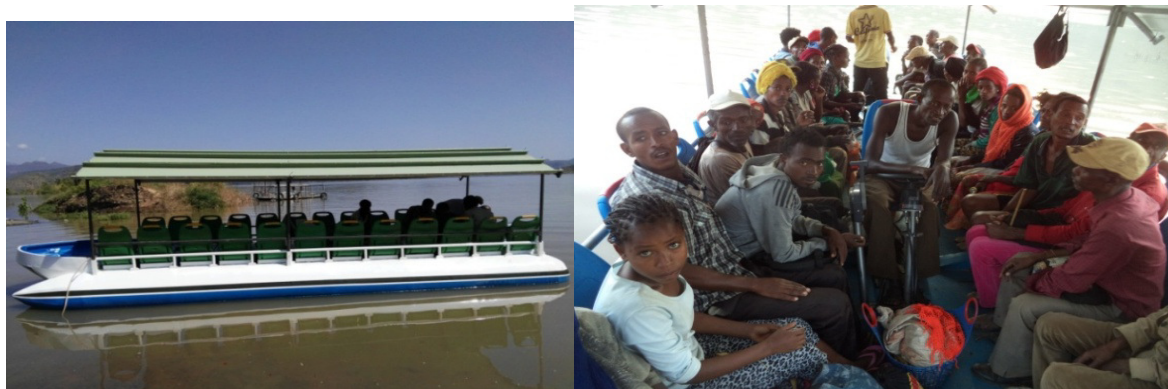
Figure 4.2 Ferryboat on the reservoir of Gibe III and people transporting ferry

Based on assurances, 12 ferryboats are provided to each woredas located in the project area. 15 days technical training was provided and this ferryboat will transport people and items with small ferry amount to cover maintenance and operating costs. Communities in the project area are encouraged to involve in fishing. Fishing gears and nets are provided by the authority and in addition to these EEP has plan to communicate Fish resource development sector of the Government to provide various fish germs for propagation on the reservoir. As per the information from EEP environmental office, the outskirts of the 150km reservoir space is planned to be further developed as a tourist attraction and recreation spot. Long term plans reveal potential scenery and tourist attraction would be created on the surroundings of the Gibe III reservoir.