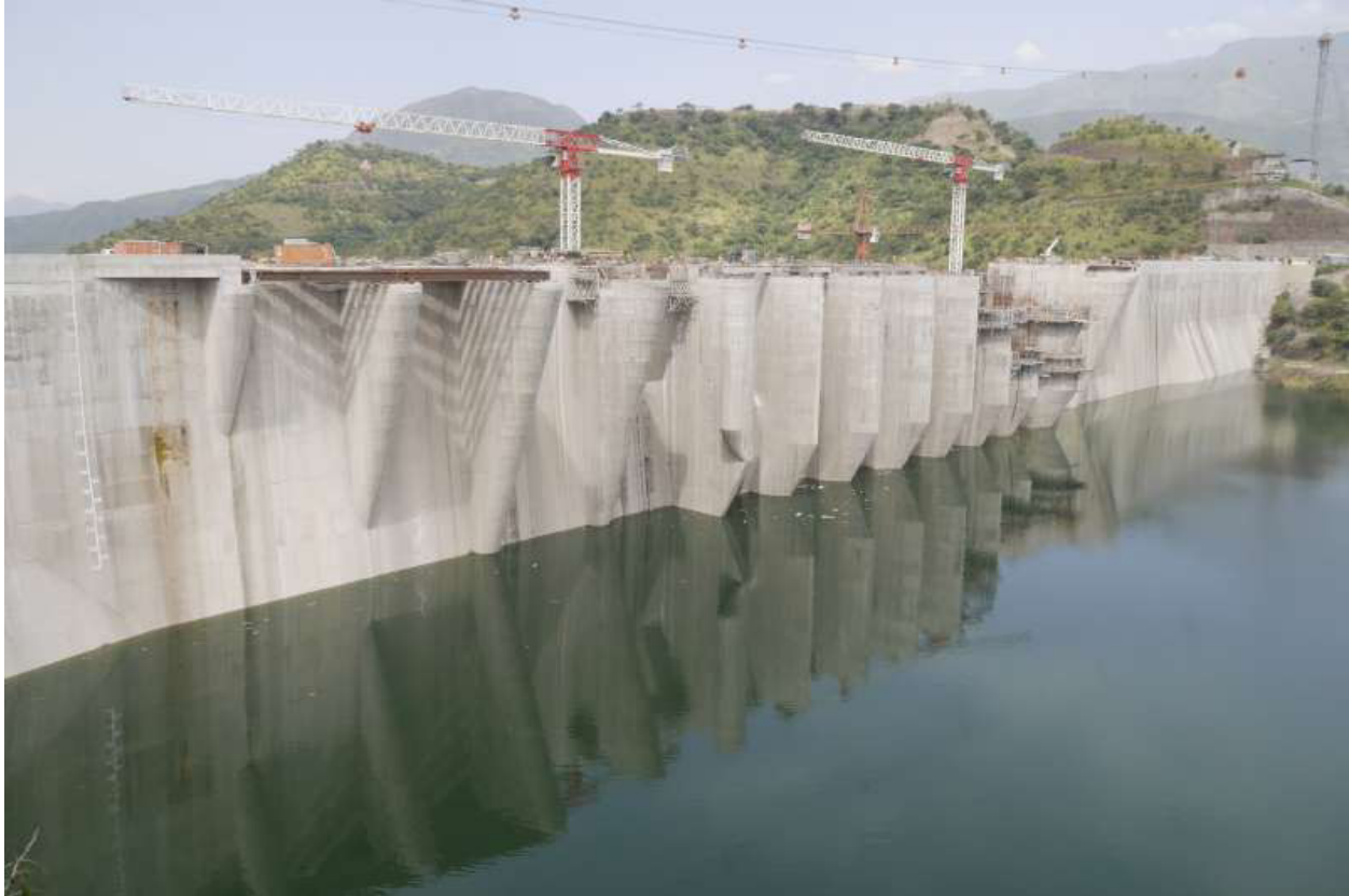
Figure 1.2 Dam upstream face view of Gibe III from the left bank

In 2006, an estimated 253,412 people were living in the 67 Peasant Associations located around the Gibe III reservoir area of which 49.9% were males and 50.1% were females. More than 13 different ethnic groups live around the future reservoir area (EEPCo ESIA, 2009). Though the study focuses mainly on the social capital effects of the project upstream area, a brief overview on the downstream area inhabitants is also included. The project downstream areas are Hamer, Dasenech and Nyangatom Woredas of the SNNP region. The major health problems of the project area are reported to be infectious diseases and malnutrition. Poor sanitation and low living standards are common features in the project area.