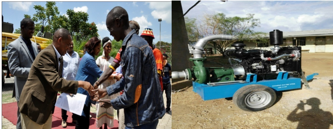
Figure 4.1 Downstream area pump handover

Land is state owned and the most common land acquiring means is through inheritance. as per the proclamation no 455/1995 a woreda or an urban administration shall, upon payment in advance of compensation in accordance with this proclamation, have the power to expropriate rural or urban landholdings for public purpose where it believes that it should be used for better development project to be carried out by public entities. Therefore, the local administration carried out the resettlement and compensation issues long before the project commencement.