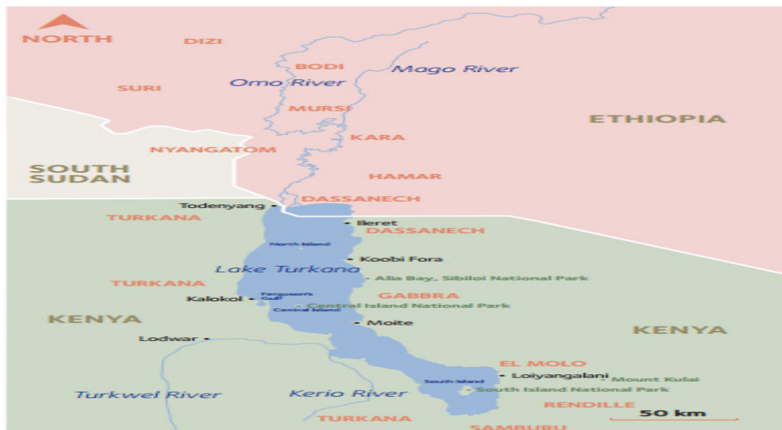
Figure 1.4 Downstream areas of the project