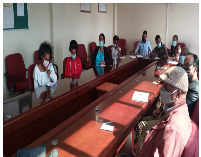
TC staff attending First Aid training

TC staff attending editorial training The second presentation was based on the CD prepared by 'Tebita Ambulance Service' on the topic, First Aid Application and Basic Principles , aimed at updating the staff. The panel entertained a warm discussion.