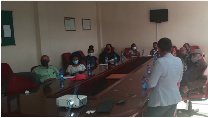
TC staff attending training on Gender Issues

Half day training on Gender and Management vs. Leadership aimed at raising the awareness of TC staff was conducted in collaboration with GHAPCO.