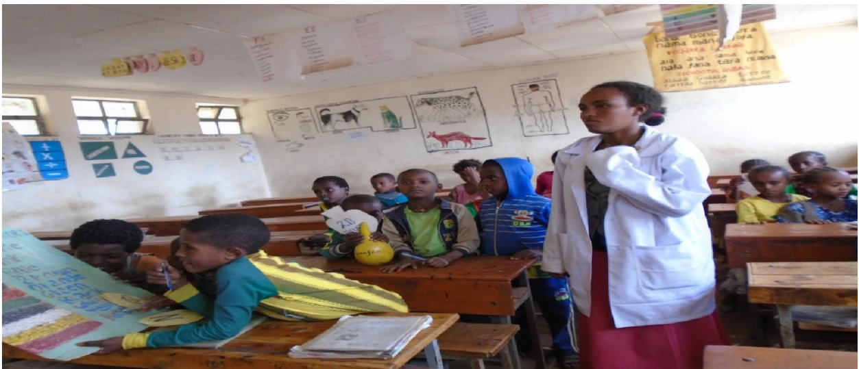
Picture2. Print rich environment including reading wall and teaching aids prepared from locally available materials, in LB intervention school ( Gerbabu primary school)