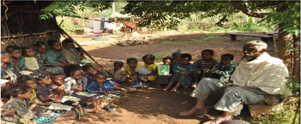
Picture1. A community elder telling story for the children at reading camp ( Shukura Village)