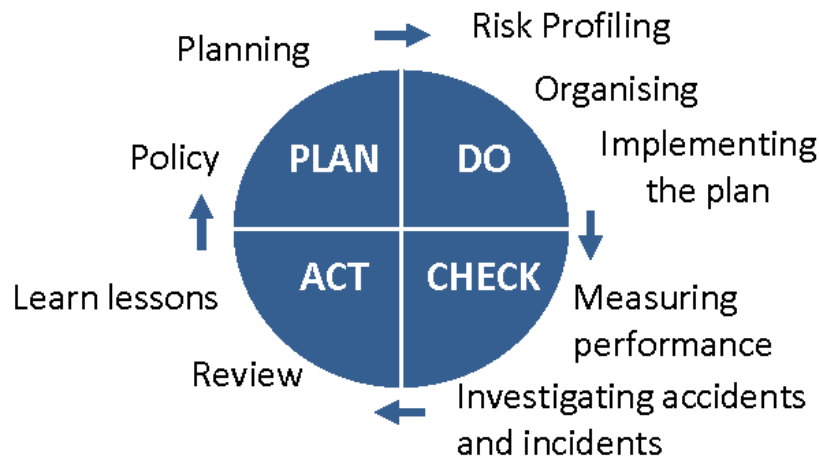
Figure 2.2.4-1: Health and Safety Monitoring and Reviewing