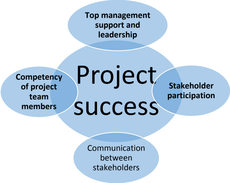
Figure 1. Conceptual Framework